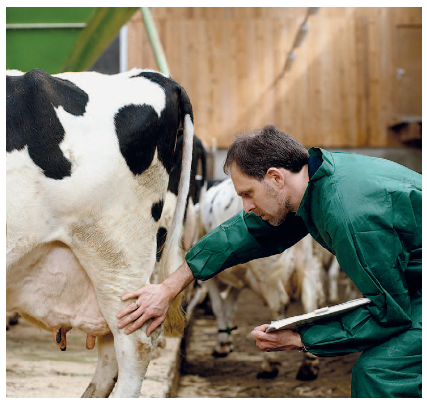
Figure 5: Assessment of the joints at a real-life farm

** Evaluation range: ++/+/\circ/-/--(\circ = standard)