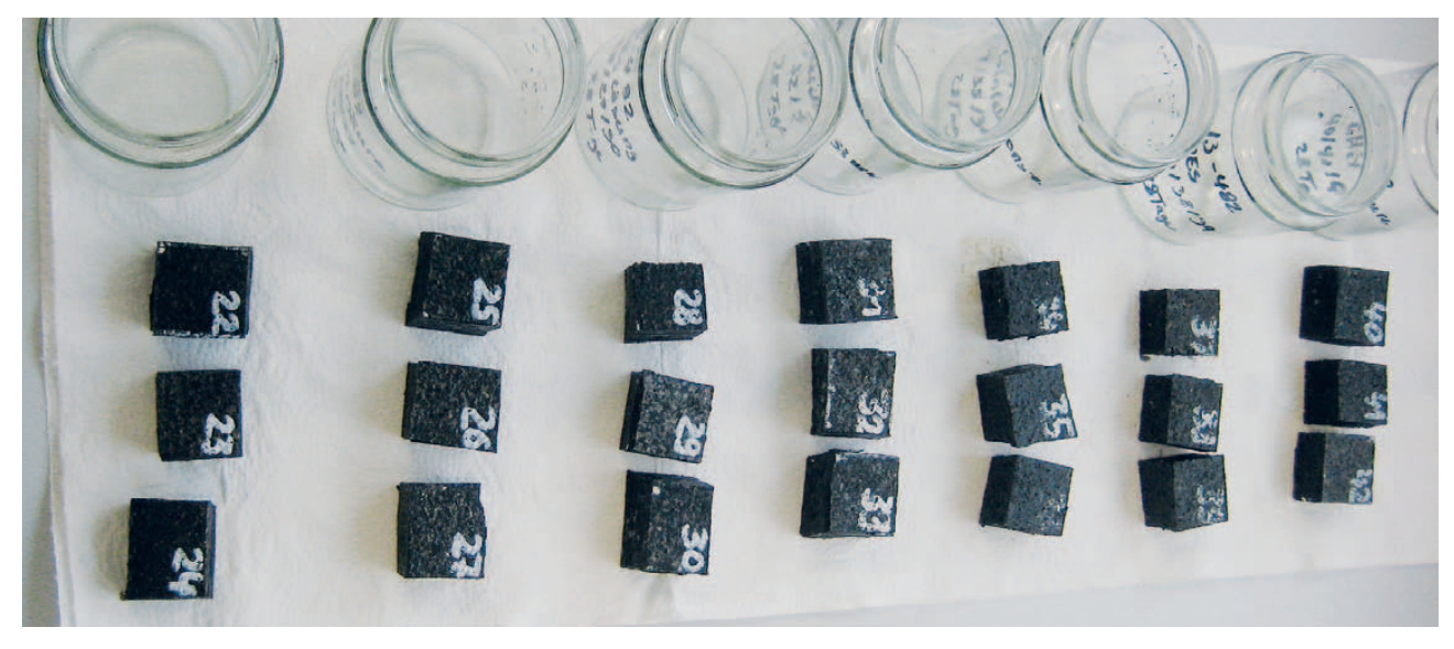
Figure 4: Test samples after acid-resistance test