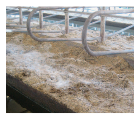
Figure 2: Blister mat installed

The mats are fastened to the designated fastening points on the floor using 12 bolts plus washers and dowels.