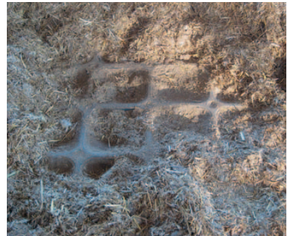
Figure 3: Blister mat installed, with straw chaff litter (litter removed so that mat is visible)